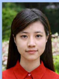
Background not plain