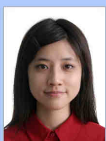
Shadows on face