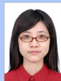
Frame covering eyes