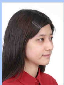
Not facing camera