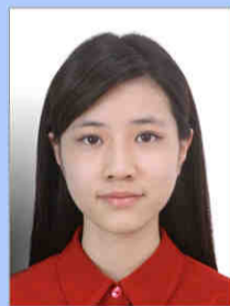
Shadows on background