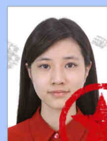
Stamp or other patterns on photo