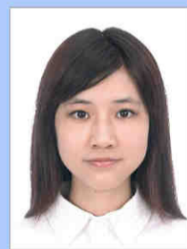
Clothes color identical to background