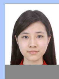
Damaged photo or other defects