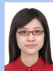
Frame too thick