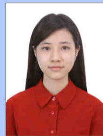
Head too small