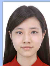
Head too big