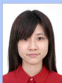
Hair covering eyes, eyebrows or ears