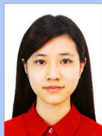
Contrast too high